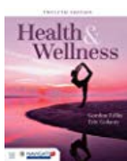
Health and Wellness