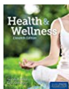
Health & Wellness, 11th Edition